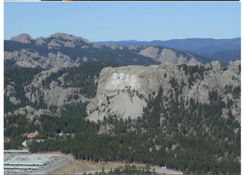
TOP: Jackson Hole, WY. MIDDLE: Devil's Tower, South Dakota. BOTTOM: Mt. Rushmore, SD