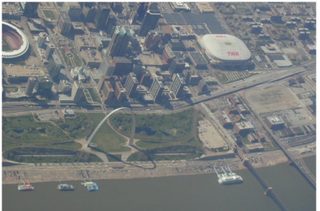
St.Louis, home of the author's former employer, Annheuser-Busch, as seen from an RV.