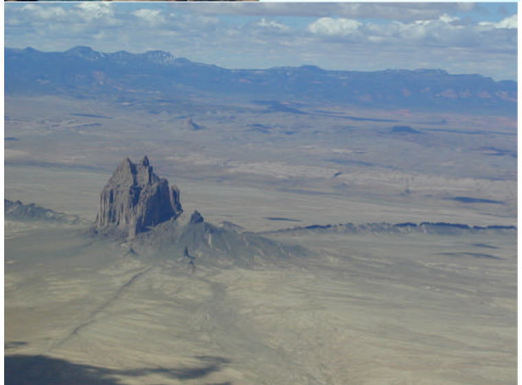
TOP: Bryce Canyon. MIDDLE: Lake Powell. BOTTOM: Ship Rock