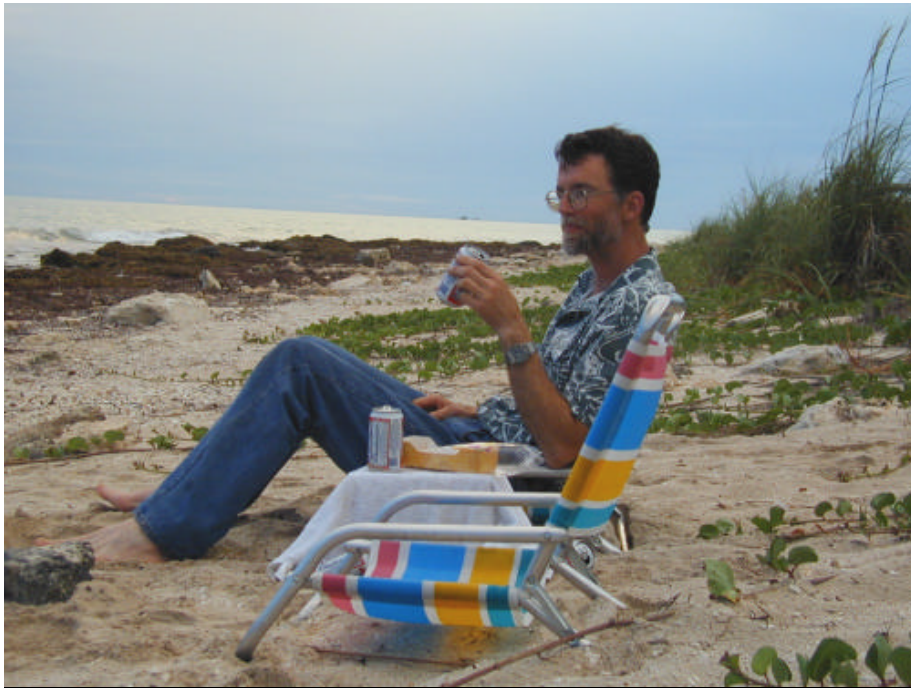
The author contemplates the exotic sunset with a Bud.

street with amusement rides and food booths. Definitely Mayberry. I was sitting at a table gnawing on a smoked turkey leg. I asked the guy across the table about the houses. One of them was used in "A League of Their Own" with Madonna. This guy works for Willamette Industries of Portland.