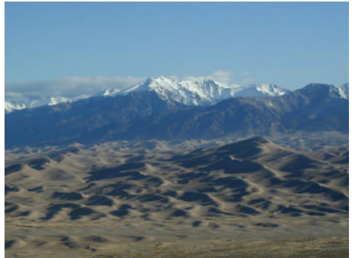
Great Sand Dunes National Monument in Colorado.

Meanwhile, an incredible low- pressure system was building over Minnesota. The day we leave Ohio we see headwinds of 40-50 knots. By afternoon we are only to Wichita. Ellen, a veteran of hundreds of hours of RV time, blows breakfast. At 1500' AGL I am seeing 120 knots groundspeed and constant light to moderate turbulence. At 2000' AGL it drops to 115. At 2500' we see 110 but surprisingly it is smoother. A pilot reports to FlightWatch that he has 93 kt winds at flight level 17. We decide to call it a day. Ten seconds after touchdown Ellen blows lunch. ("hey, my landing wasn't THAT bad") A clerk helps us locate "dramamine" at the Wal-