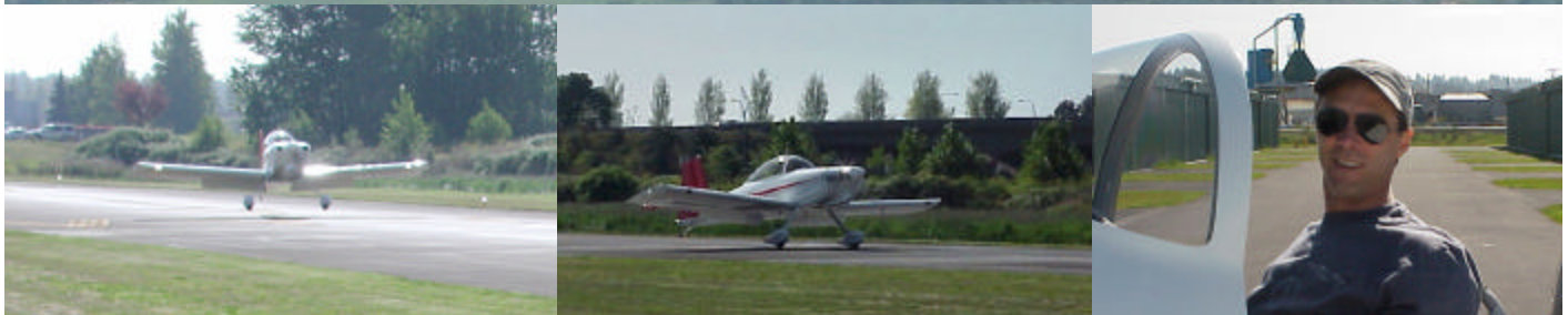
Editor Randy Lervold made the first flight of his RV-8, N558RL, on 5/3/01. TOP LEFT: first ru-nup. TOP CENTER: on the active, ready to go. TOP RIGHT: air under the wheels! CENTER: 3,000 ft on second flight. BOTTOM LEFT: first landing pre-touchdown. BOTTOM CENTER: first landing. BOTTOM RIGHT: The RV Grin! (see page 3 for story)