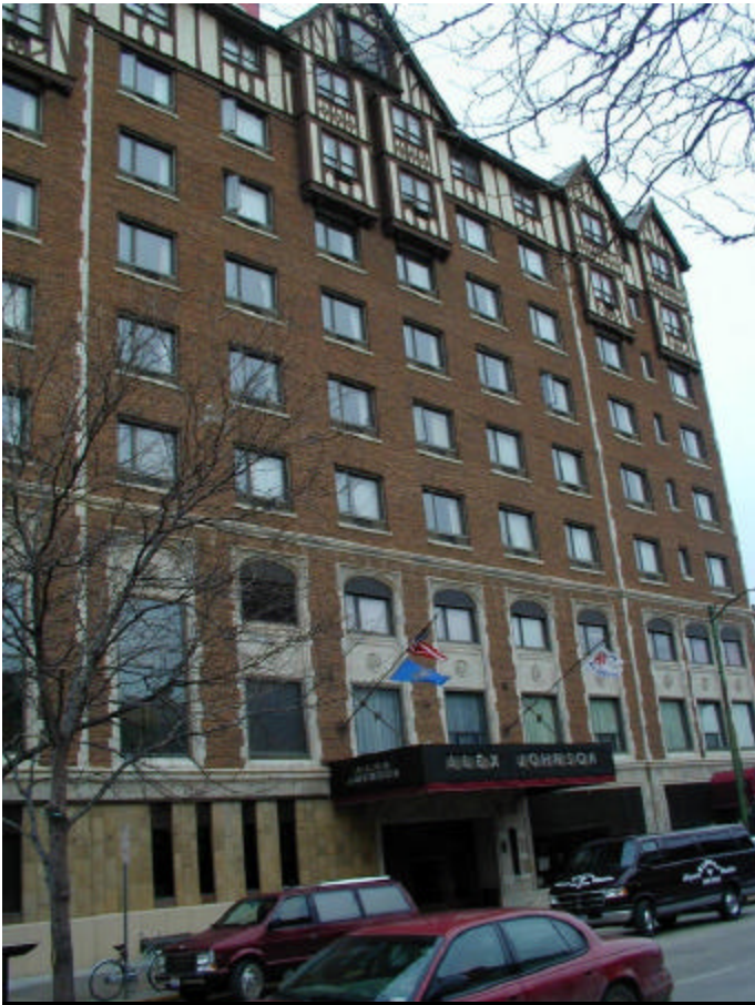
Historic Alex Johnson Hotel in Rapid City.

a try, returning if need be. Departure wanted to know our cruising altitude. I told him 1500'. We flew at 125 kts. And soon were able to reach 2500', which put us 500-700' above any antennas that were listed. We never saw any 4500' in Madison so flight following sent us right over Madison International at 2500' en route to our destination, Watertown.